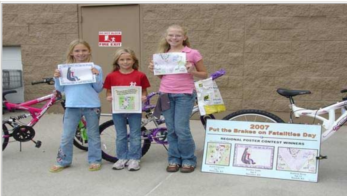
Regional winners in District three with bicycles

“You never know when you’re going to go down,” Crow said. “You may be the best rider ever, but you can’t stop someone pulling out in front of you. So you need to wear your helmet and safety equipment all the time.”